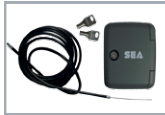
External manual release in option for power failures