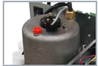
Electric motor immersed in oil bath