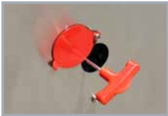
Unique manual release with lever (no crank needed)