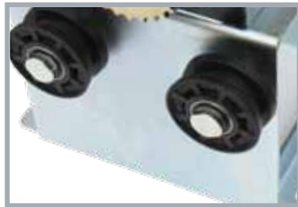
Ball bearing wheels to grant a better performance